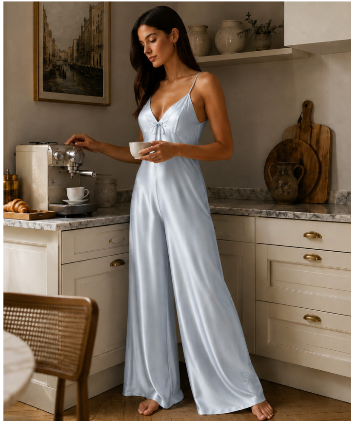
JUMPER STYLE: RACHAEL CONTENT: 95% BAMBOO 5% ELASTANE COLOR: STEEL