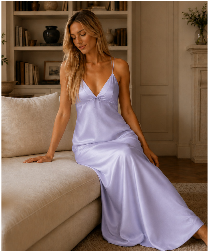
MAXI GOWN STYLE: LUCILE CONTENT: 95% BAMBOO 5% ELASTANE COLOR: LILAC