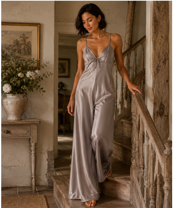
JUMPER STYLE: RACHAEL CONTENT: 95% BAMBOO 5% ELASTANE COLOR: TAUPE