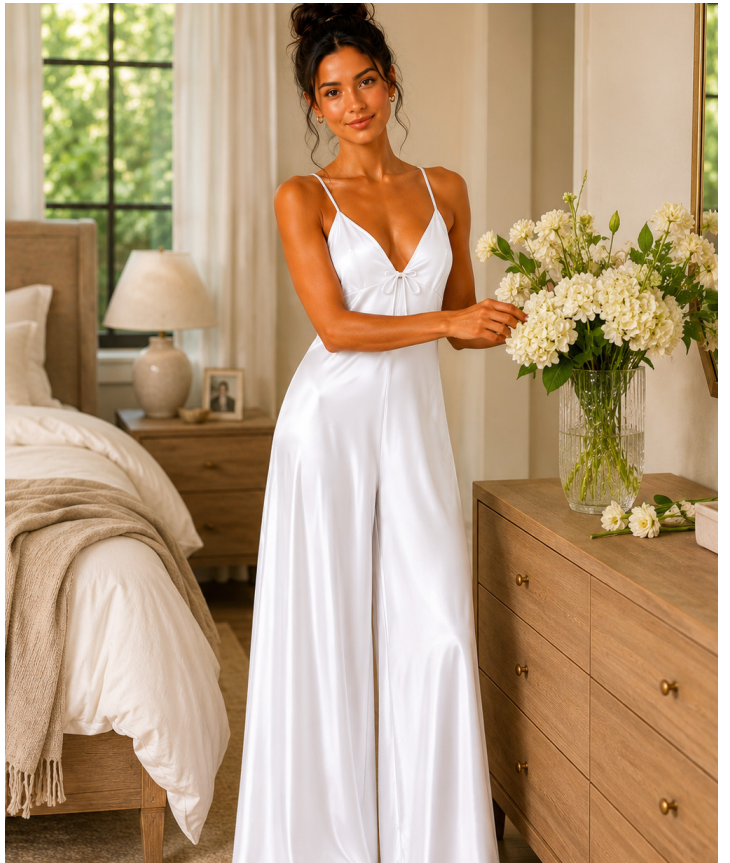
JUMPER STYLE: RACHAEL CONTENT: 95% BAMBOO 5% ELASTANE COLOR: MILK