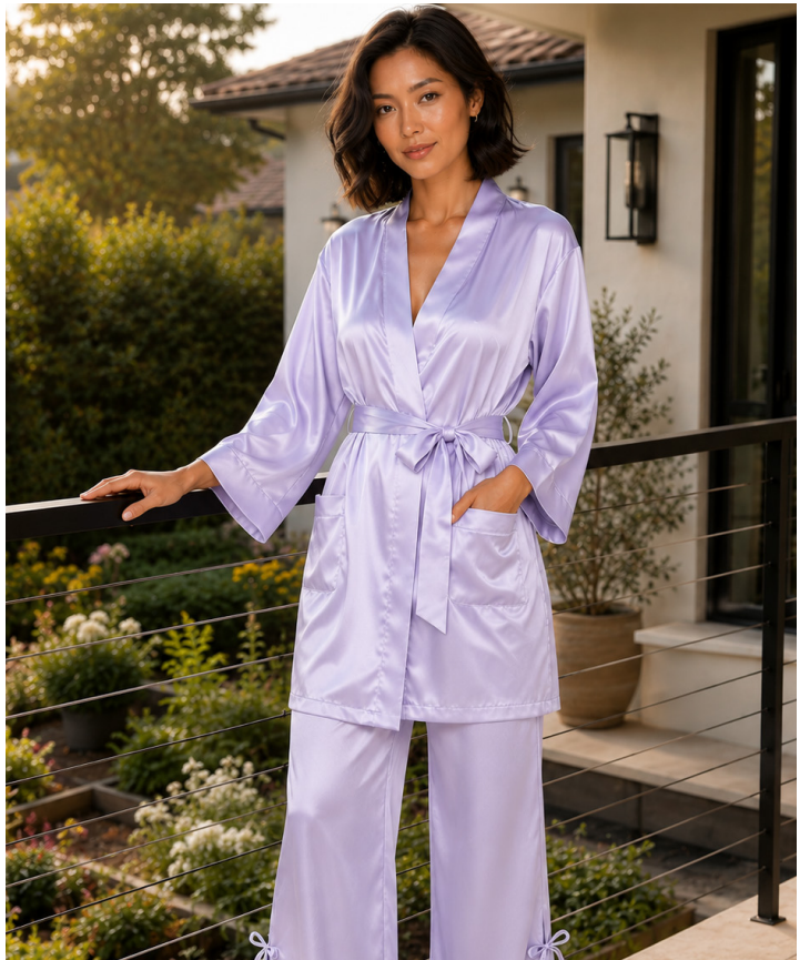
KIMONO PAJAMA STYLE: CHRISTIANE CONTENT: 95% BAMBOO 5% ELASTANE COLOR: LILAC