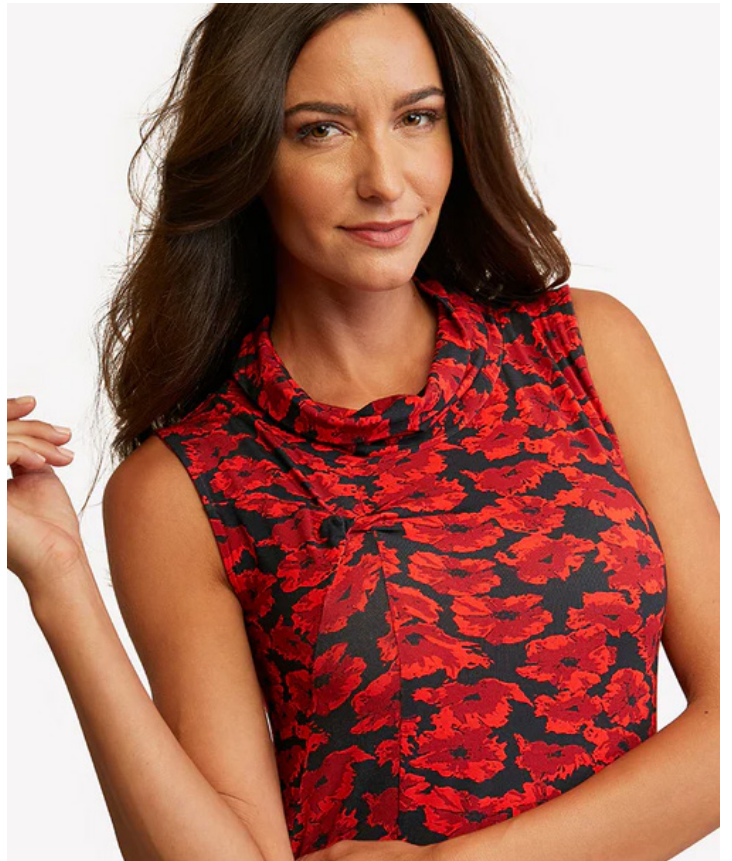
COWL NECK DRESS WITH POCKETS STYLE: POPPIES FIELD CONTENT: 95% MODAL 5% SPANDEX COLOR: BLUEBERRY / FIERY RED PRINT: POPPIES