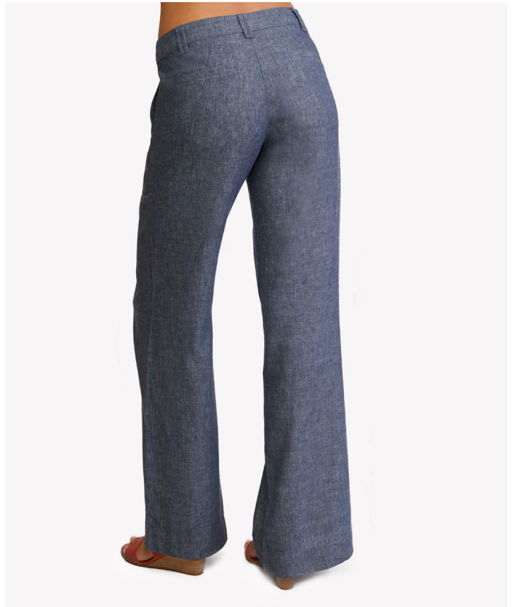
WIDE LEG TROUSER STYLE: MONTMARTRE CONTENT: 55% LINEN 45% COTTON COLOR: BLUE MOOD INDIGO