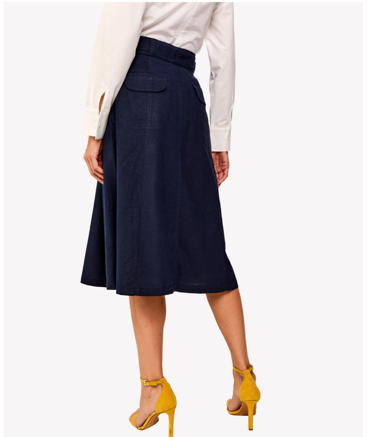
A-LINE PANEL SKIRT WITH POCKETS STYLE: CEDROS CONTENT: 30% LINEN 70% COTTON COLOR: SARGASSO SEA