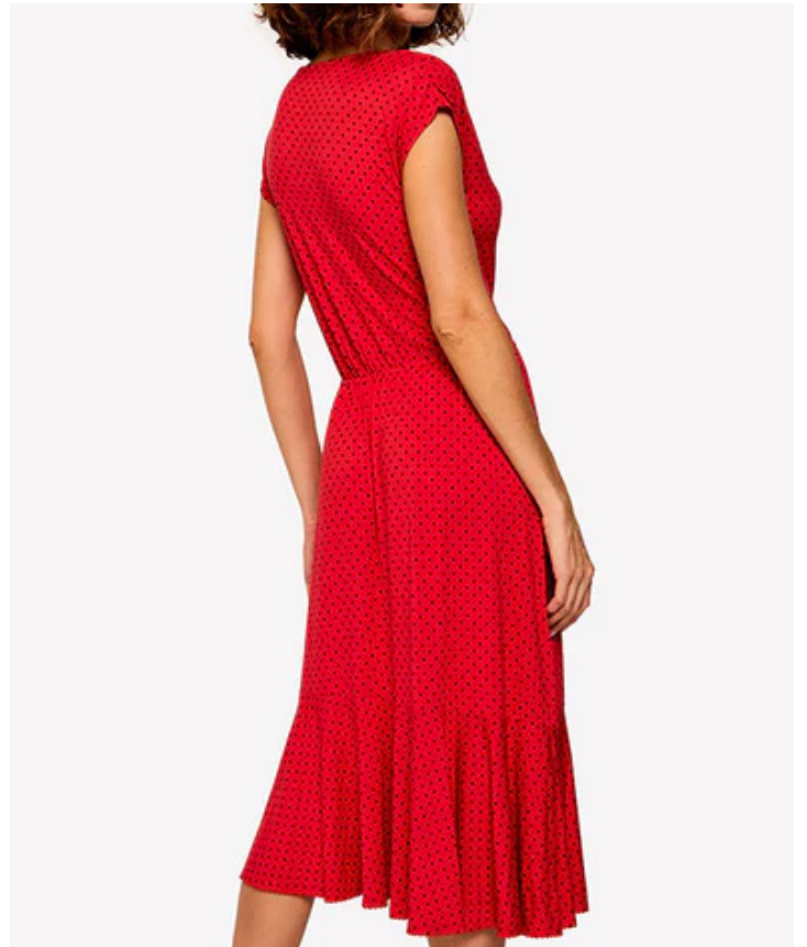
CAP SLEEVE FAUX WRAP DRESS STYLE: A PARIS CONTENT: 95% RAYON 5% SPANDEX-KNIT COLOR: MARCH RED / MARINE PRINT: POLKA DOT HEARTS