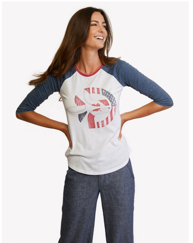
RAGLAN HALF SLEEVE TEE STYLE: CITIZEN CONTENT: 60% COTTON 40% POLYESTER COLORS: BLUE / WHITE / RED