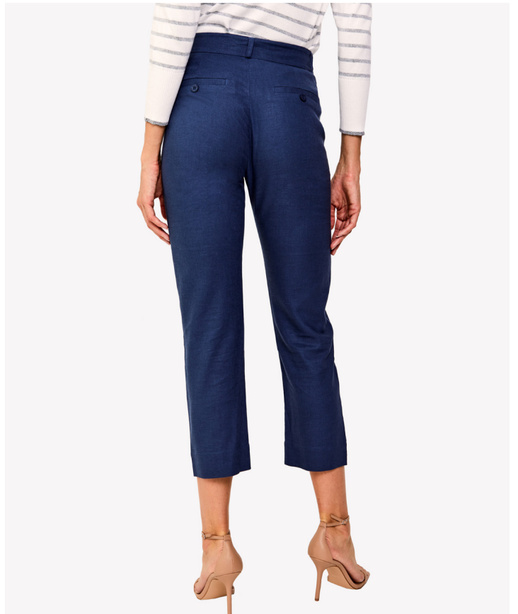
7/8 LENGTH PANTS STYLE: SOLANA CONTENT: 30% LINEN 70% COTTON COLOR: SARGASSO SEA