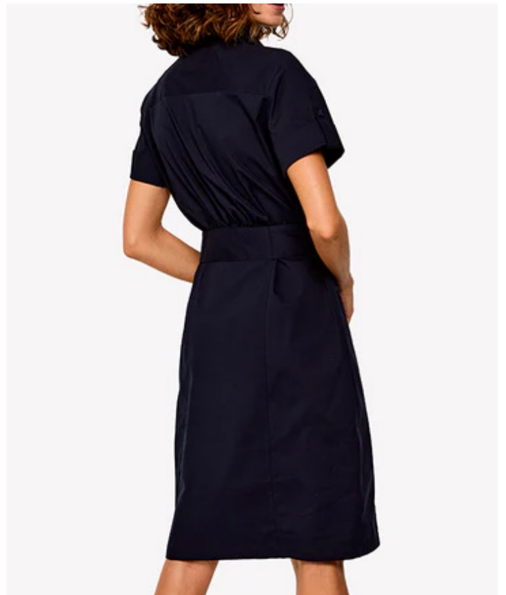
CARGO SHIRT DRESS STYLE: SAVANNAH CONTENT: 87% COTTON 3% SPANDEX COLOR: BLUEBERRY