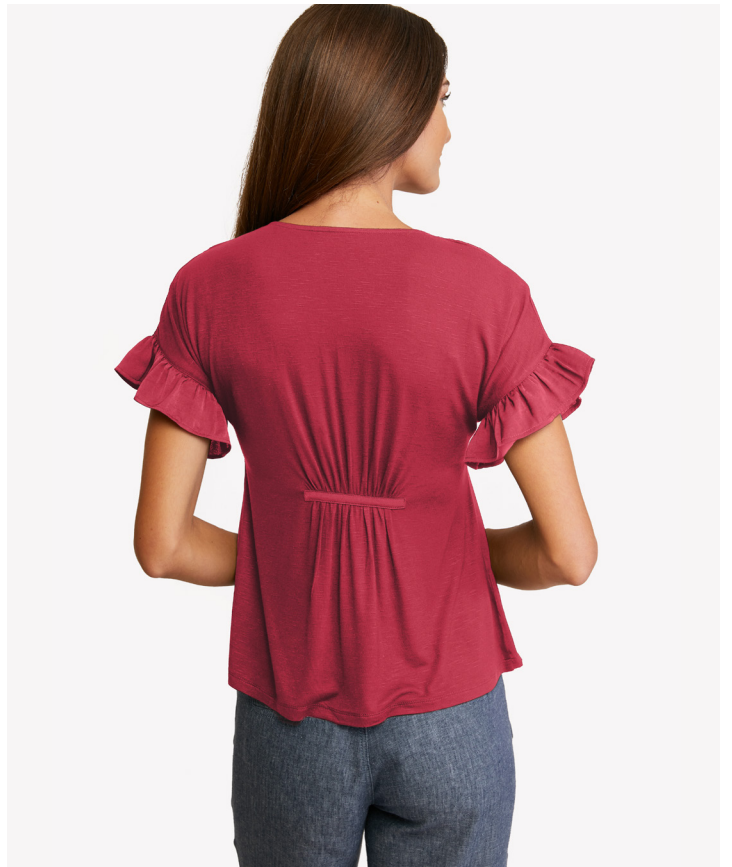
FRILLED SHORT SLEEVE PULL ON TOP STYLE: MADEMOISELLE CONTENT: 100% POLYESTER CHARMEUSE BACK: 95% RAYON 5% SPANDEX COLORS: 1-BLACK 2-MARCH RED