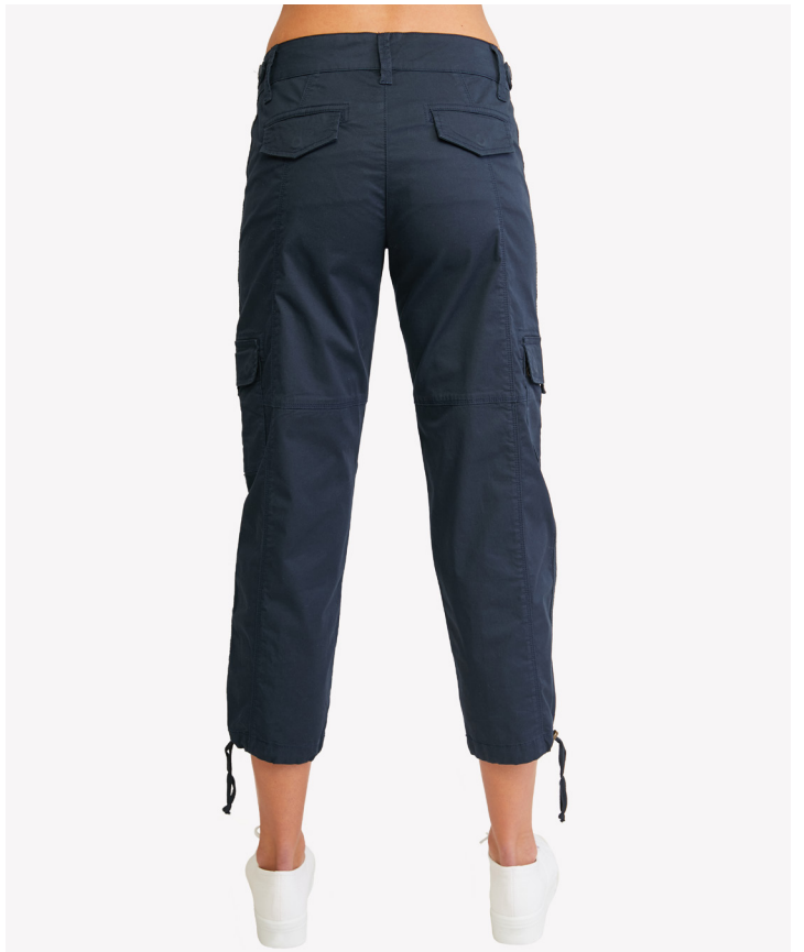
CROP CARGO POCKET STYLE: LOT CONTENT: 97% COTTON CANVAS 3% SPANDEX COLOR: BLUEBERRY