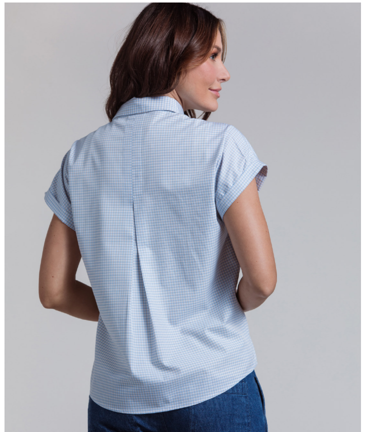
RELAXED SHORT SLEEVE SHIRT STYLE: CAITLIN CONTENT: 50% POLYESTER, 30% TENCEL, 20% RAYON FROM BAMBOO COLOR: GINGHAM, BLISSFUL BLUE/OC