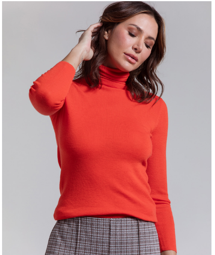
TURTLENECK TOP SEAMLESS SWEATER KNIT STYLE: SYLVIANE CONTENT: 100% FINE MERINO WOOL COLOR: LINEN. TURKISH COFFEE. ORANGE ZEST.