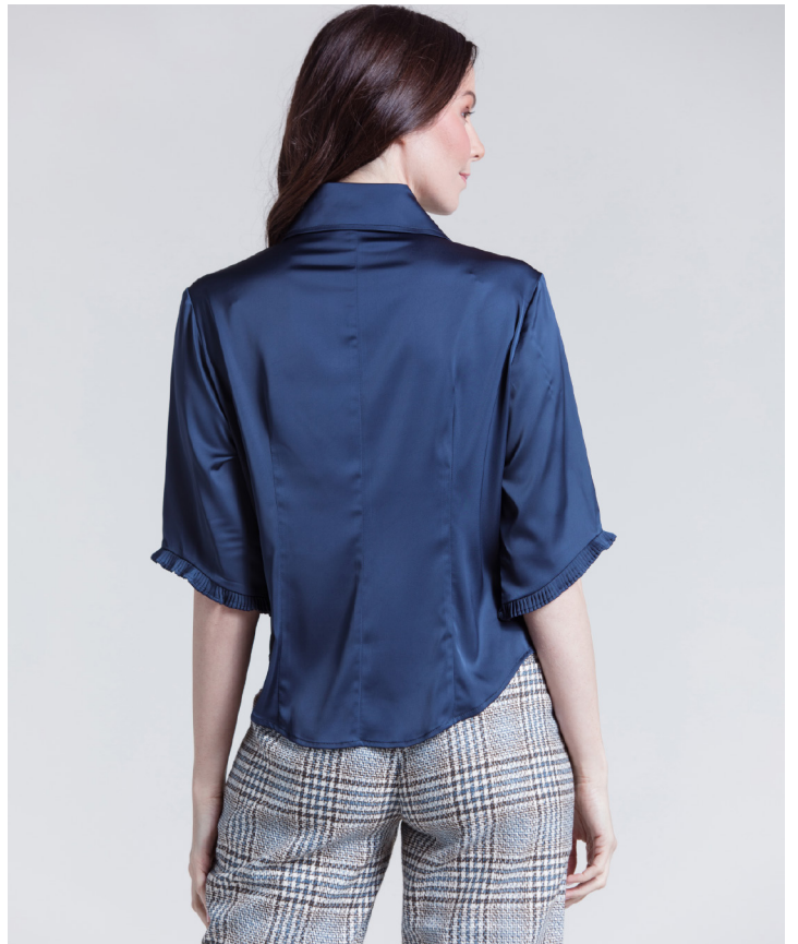
FRILL SHIRT WITH HIGH STAND COLLAR STYLE: FANNY CONTENT: CHARMEUSE 97% POLYESTER 3% SPANDEX COLOR: MIDNIGHT