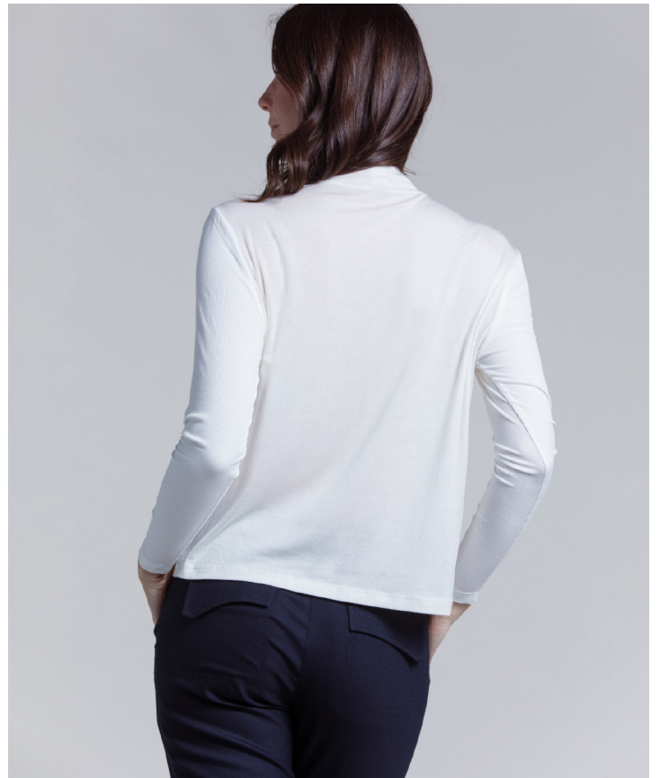
PLEATED FUNNEL-NECK KNIT TOP STYLE: JOJO'S VERSATILE CONTENT: 11% CASHMERE 83% TENCEL 6% SPANDEX COMBO: 36% ACETATE 27% VISCOSE 10% SPANDEX COLOR: MILK