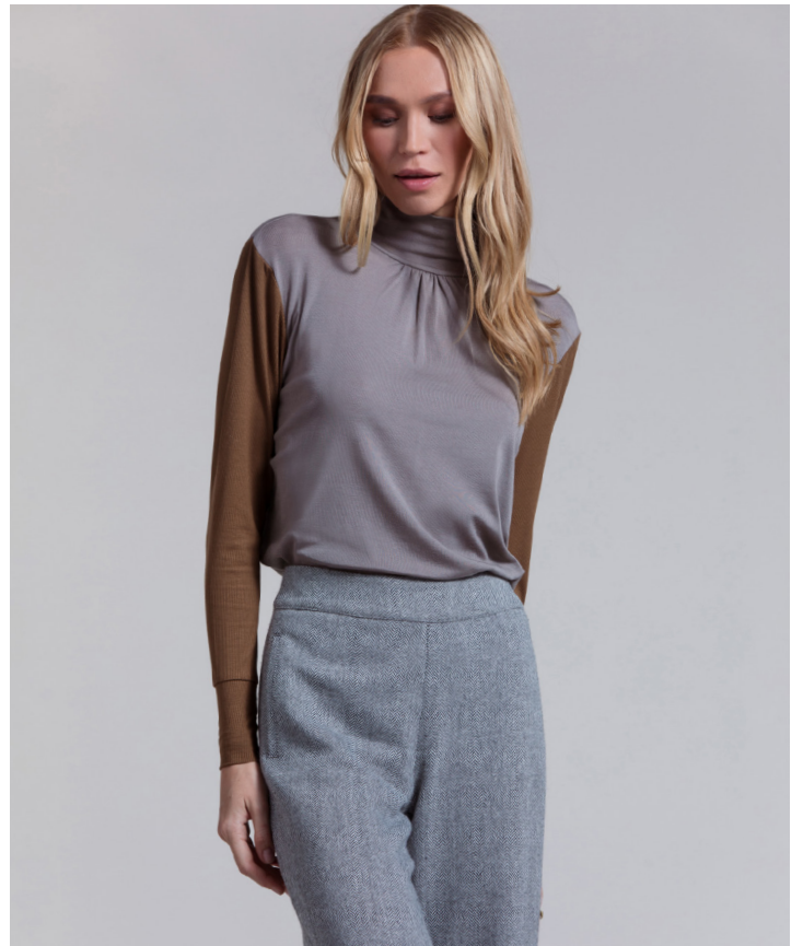
PLEATED FUNNEL NECK TOP STYLE: JOJO'S VERSATILE CONTENT: 11% CASHMERE 83 % TENCEL 6% SPANDEX COMBO: 36% ACETATE 27% VISCOSE 10% SPANDEX, KNIT COLOR: MOYEN SILVER COMBO: NUTRIA