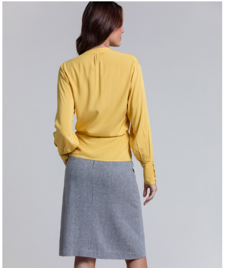
PLEATED KIMONO SHIRT STYLE: ALANA CONTENT: 30% TENCEL 70% RAYON COLOR: MISTED YELLOW