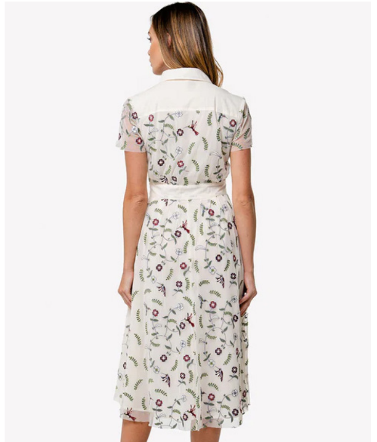
EMBROIDERED SHIRT DRESS STYLE: KATIA CONTENT: 100% NYLON MESH ALLOVER EMBROIDERY: HUMMINGBIRD FULLY LINED: 100% COTTON VOILE COLOR: ALMOST WHITE