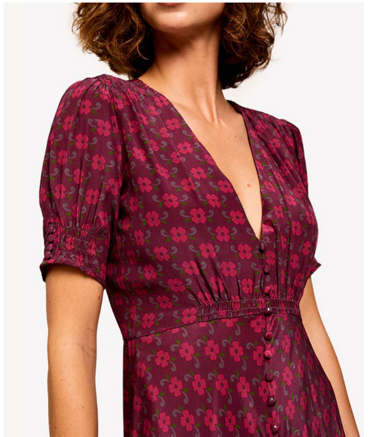
V-NECK MIDI DRESS STYLE: PRISCILA CONTENT: BUBBLE RAYON FULLY LINED: COTTON VOILE COLOR: PORTO/FARO PRINT: FARO