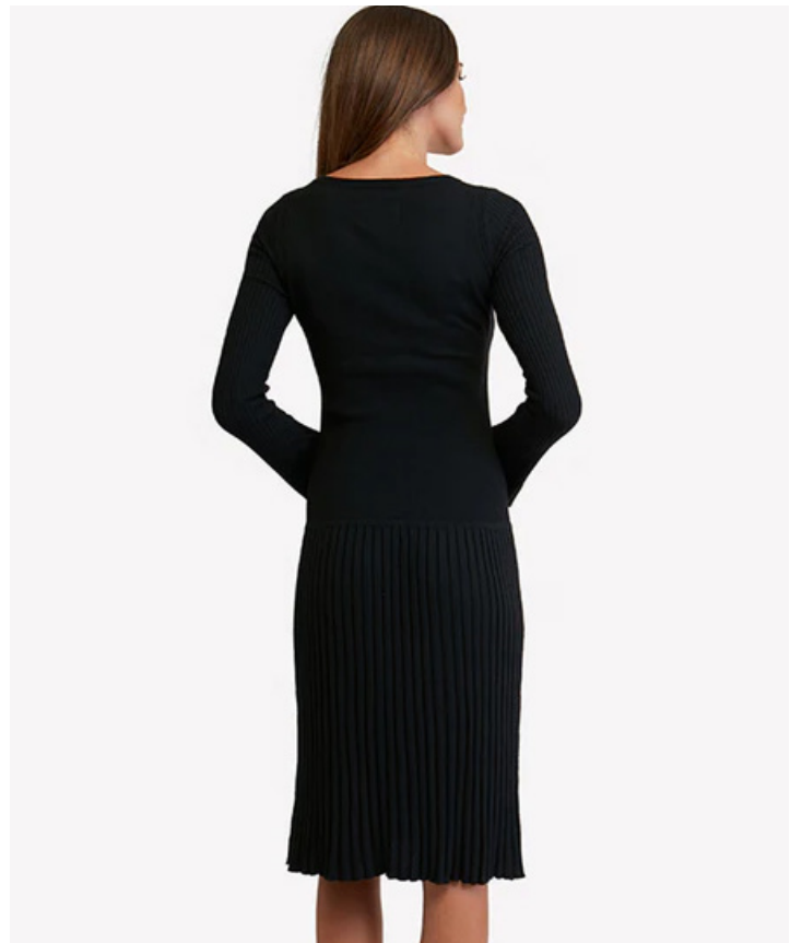
FULLY FASHION KNIT- PLEATED DRESS STYLE: ODILE CONTENT: 30% WOOL 10% CASHMERE 30% RAYON 30% NYLON COLOR: ANTHRACITE BLACK