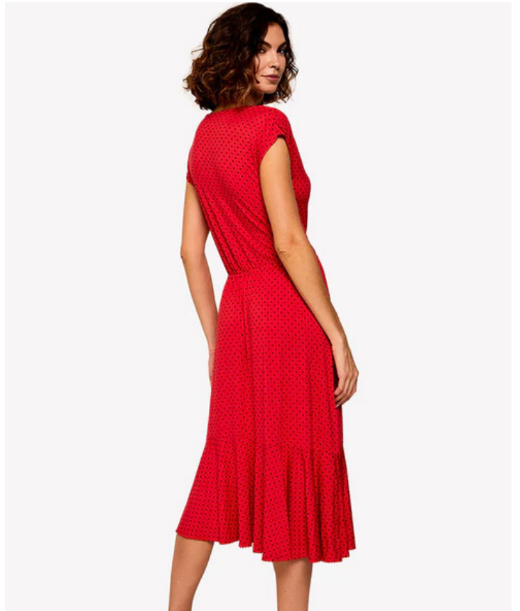
CAP SLEEVE FAUX WRAP DRESS STYLE: A PARIS CONTENT: 95% RAYON 5% SPANDEX- KNIT COLOR: MARCH RED/ MARINE PRINT: POLKA DOT HEARTS