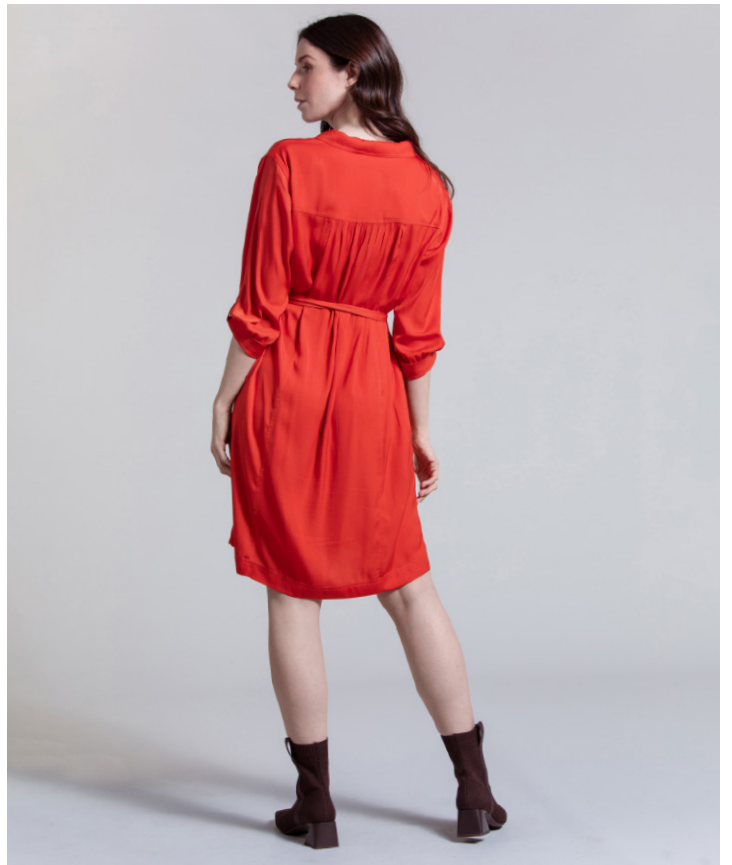
PULL ON SHIRT DRESS STYLE: ELLA CONTENT: CHARMEUSE 100% POLYESTER COLOR: ORANGE ZEST