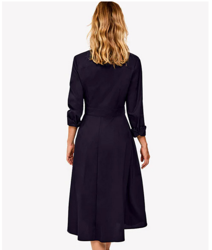
SHIRT DRESS WITH POCKETS STYLE: ELYSEES CONTENT: 68% COTTON 27% POLYAMIDE 5% SPANDEX COLOR: DARK NAVY