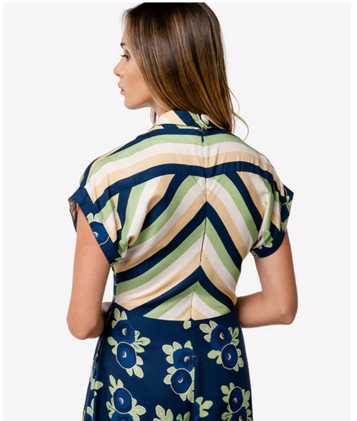
MIDI DRESS STYLE: FIGUEIRA CONTENT: 100% TENCEL PRINT: FIG COLOR: FIG, FEUILLAGE, MOOD'INDIGO