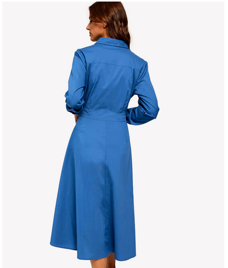
SHIRT DRESS WITH POCKETS STYLE: ELYSEES CONTENT: 68% COTTON 27% POLYAMIDE 5% SPANDEX COLOR: FRENCH BLUE