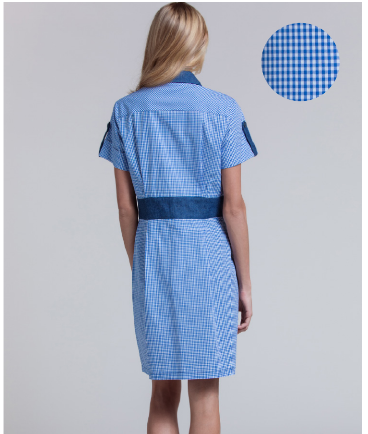
UTILITY DRESS STYLE: SAVVY CONTENT: SELF: 100% COTTON COMBO: 55% HEMP 45% ORG. COTTON COLOR: BARDOT CHECKER & DENIM