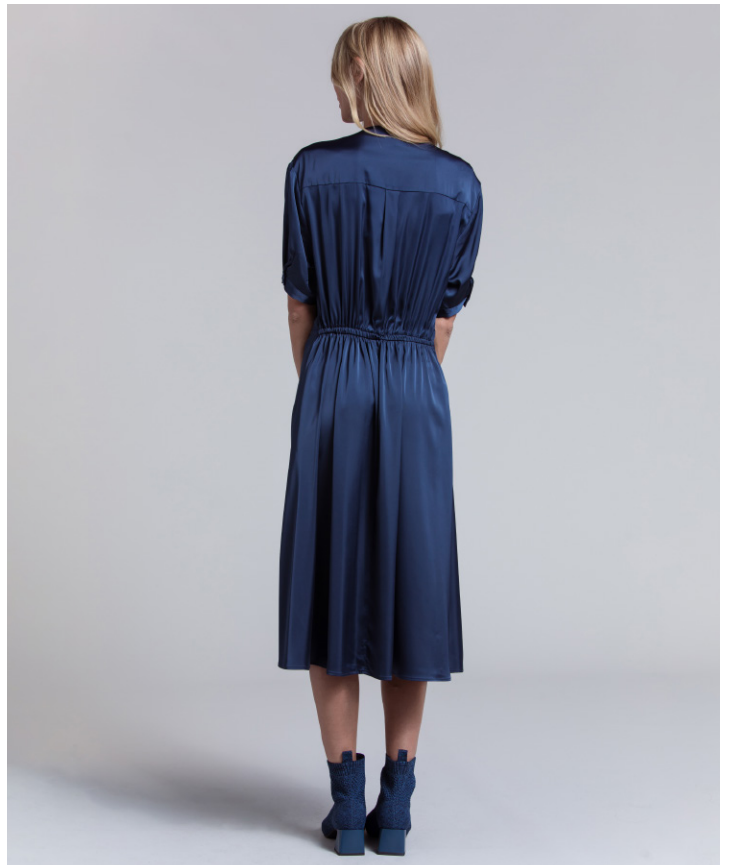
UNLINED FAUX WRAP DRESS STYLE: HANNAH CONTENT: CHARMEUSE 97% POLYESTER 3% SPANDEX COLOR: MIDNIGHT