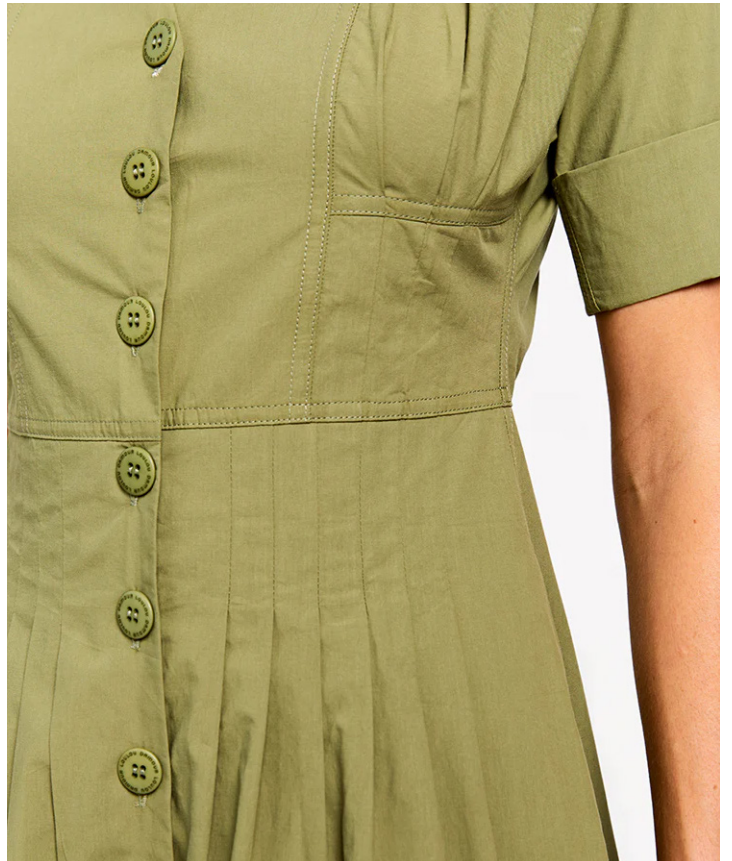
V- NECK PLEATED DRESS STYLE: CASCAIS CONTENT: COTTON COLOR: FEUILLAGE