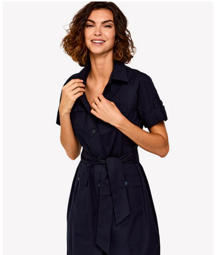
CARGO SHIRT DRESS STYLE: SAVANNAH CONTENT: 87% COTTON 3% SPANDEX COLOR: BLUEBERRY