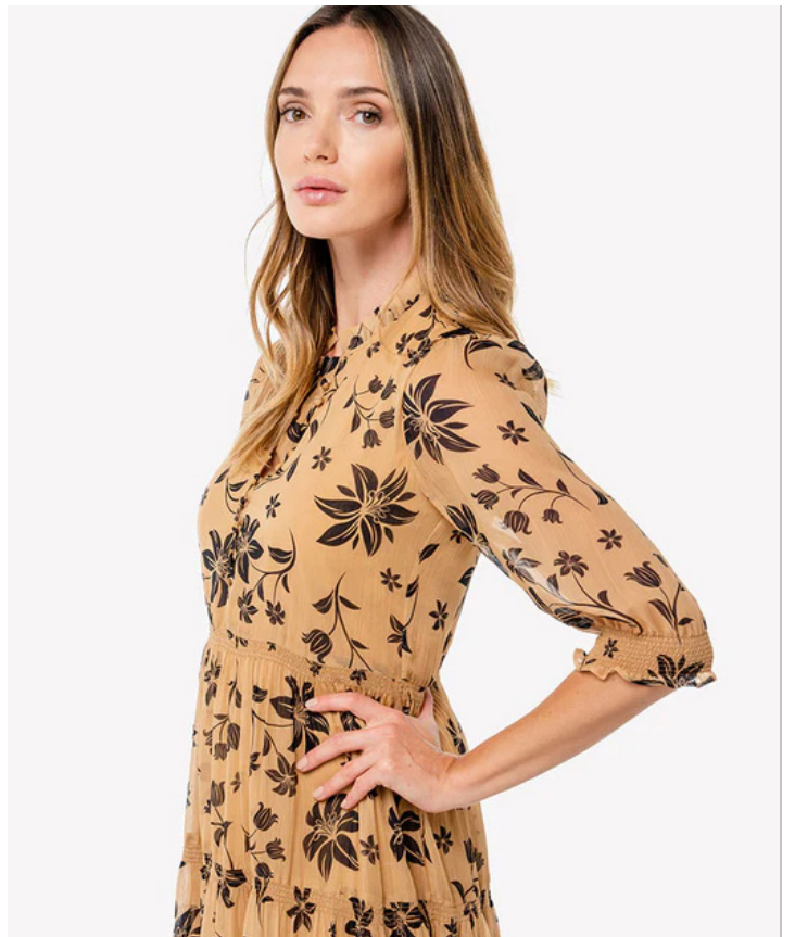
MIDI DRESS STYLE: MARAIS CONTENT: CUPRO 65% TENCEL 35% COTTON PRINT: LILI FULLY LINED: 100% COTTON VOILE COLOR: CARAMEL/ MARINE