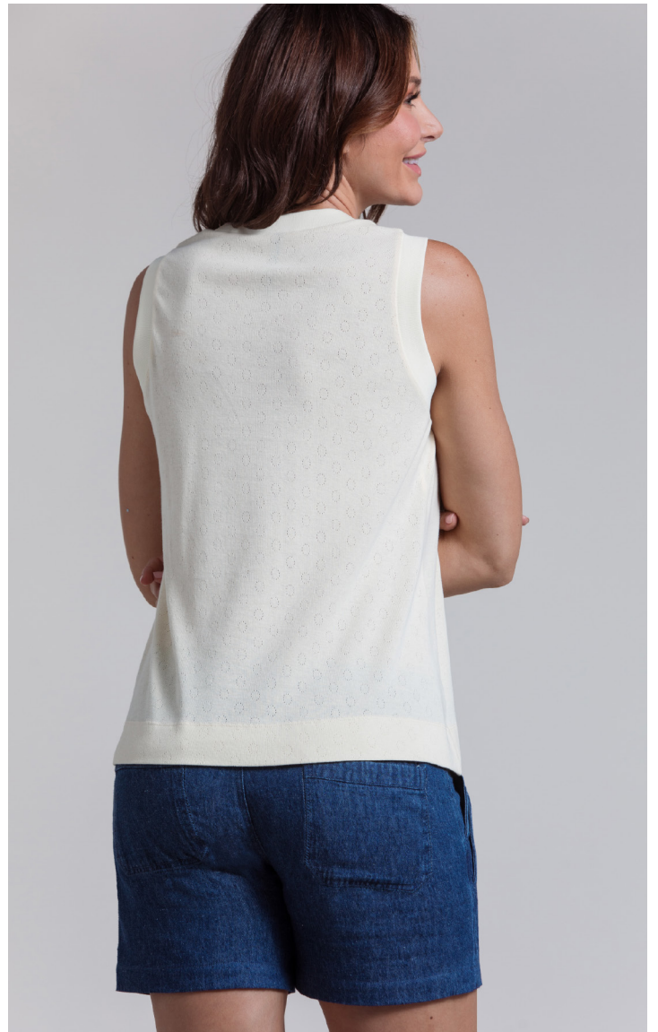
SLEEVELESS CREW TOP WITH WIDE RIB "O" POINTELLE- RELAXED FIT STYLE: JULIA CONTENT: 100% COTTON COLOR: LINEN