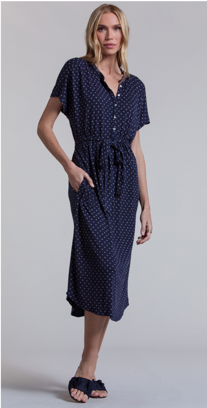
BLUE SUNRISE Size range: XS-XL & Plus 1X-3X