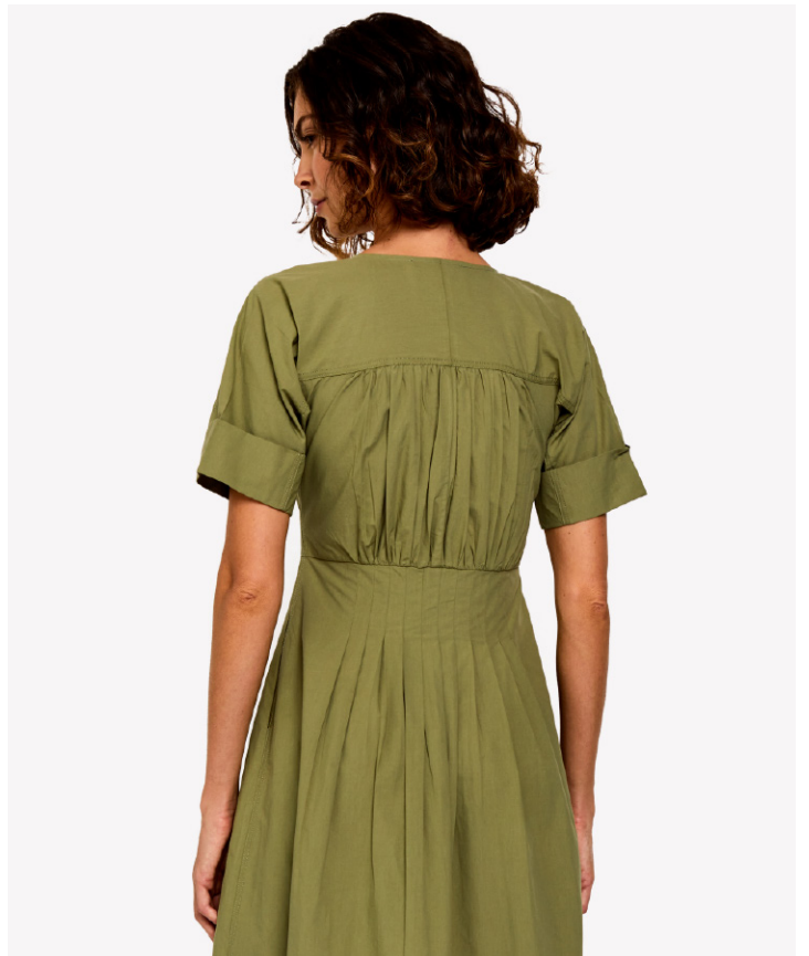
V.NECK PLEATED DRESS STYLE: CASCAIS CONTENT: 100% COTTON POPLIN COLOR: FEUILLAGE