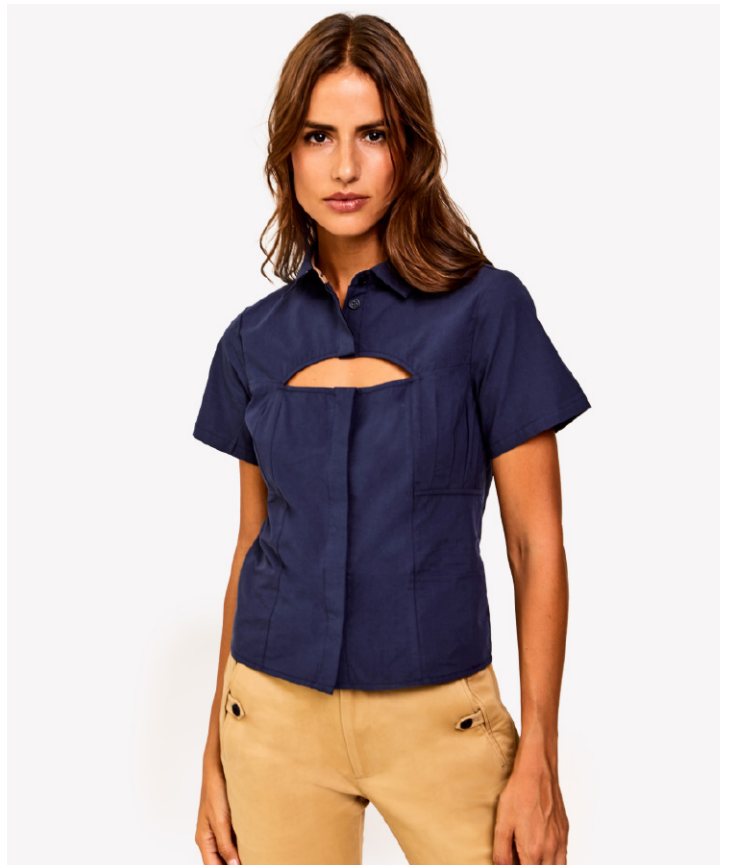
HALF MOON TOP STYLE: BRAGA CONTENT: 100% COTTON COLOR: 1. MOOD'IN. 2. LARK