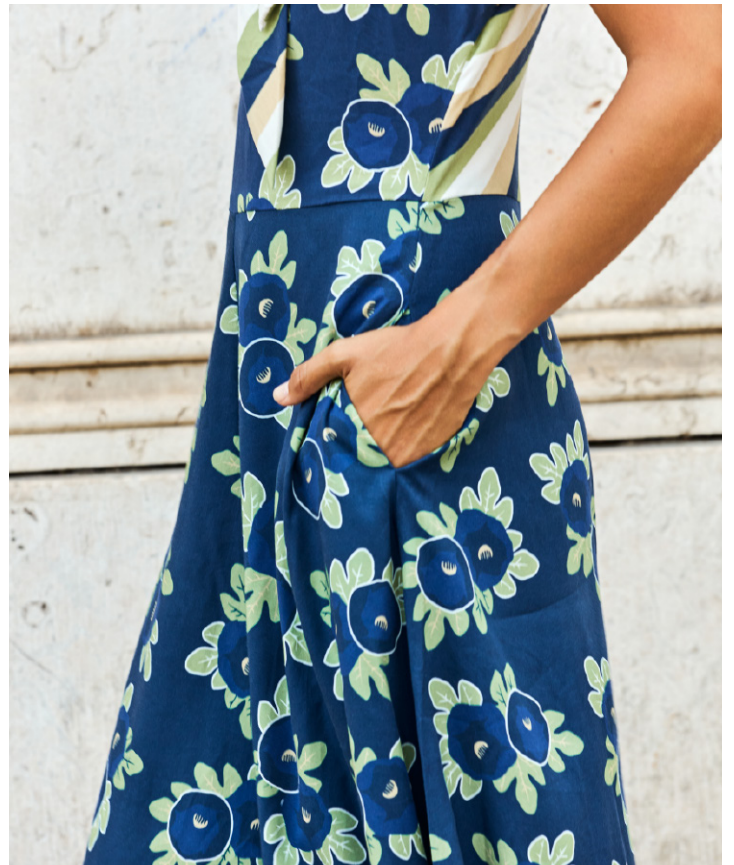
MIDI DRESS STYLE: FIGUEIRA CONTENT: 100% TENCEL COLOR: DEEP BLUE, FIG, FEUILLAGE PRINT: FIG