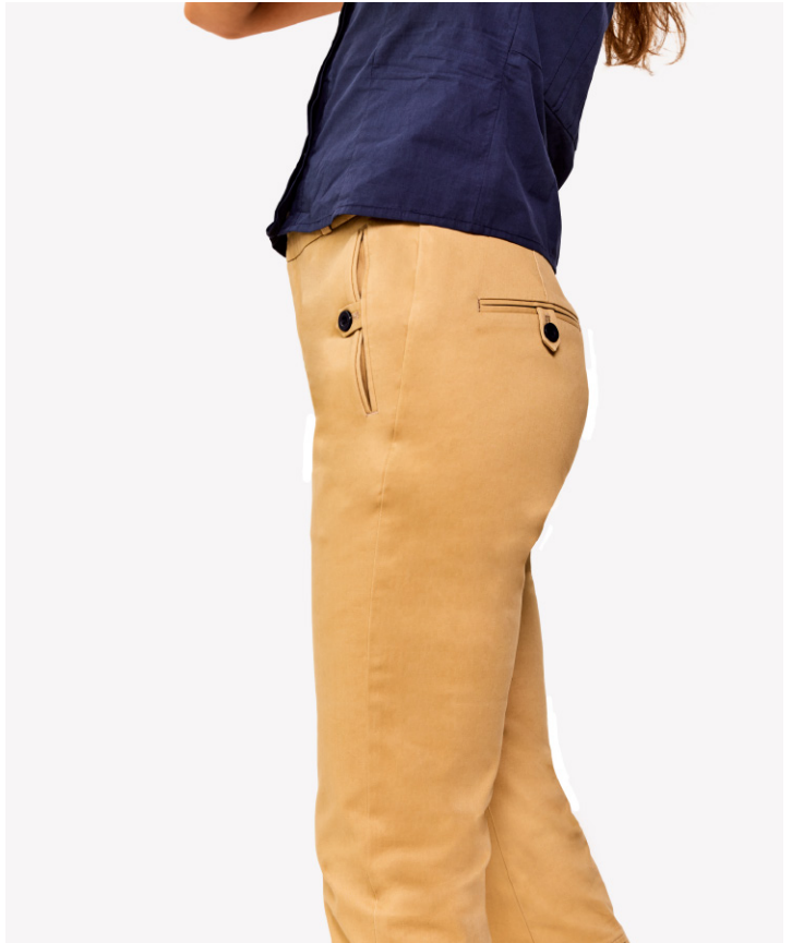
ANKLE TROUSER WITH BACK SLIT STYLE: AVEIRO CONTENT: WAXED, 50% COTTON 47% POLYESTER 3% SPANDEX COLOR: LATTE