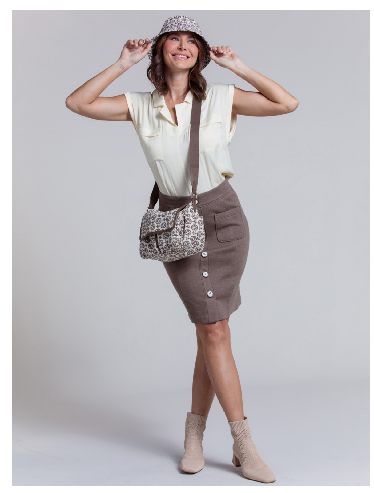
WARM NEUTRALS Size range: XS-XL & Plus 1X-3X