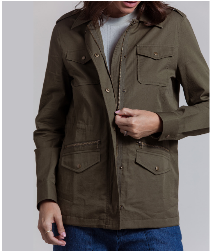
UTILITY CARGO JACKET, UNLINED STYLE: SHELLEY CONTENT: 100% COTTON CANVAS COLOR: OLIVE DRAG