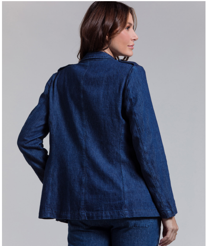
UTILITY SUIT JACKET STYLE: SARAH CONTENT: 55% HEMP 45% ORG.COTTON COLOR: DARK WASH DENIM