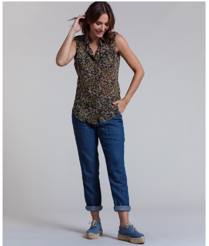
SLEEVELESS BUTTON-DOWN, SHOULDER TAB SHIRT STYLE: SUZANNE CONTENT: 100% BUBBLE RAYON COLOR: FLORAL PRINT