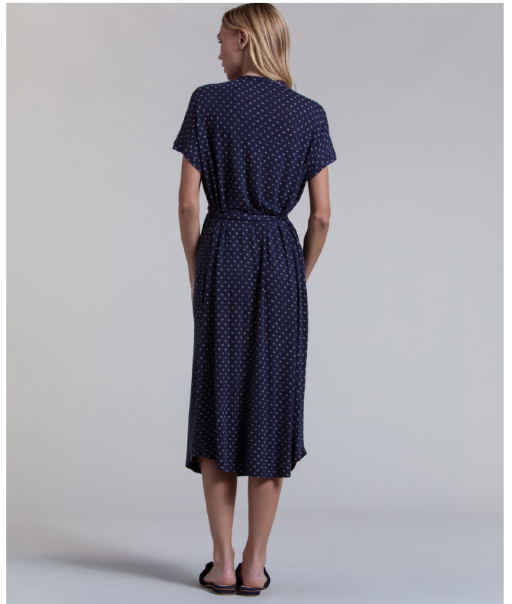
MIDI PULL-ON CAP SLV DRESS STYLE: SOPHIE CONTENT: 15% LINEN 85% RAYON- KNIT, 150GSM COLOR: DENIM, DORE PRINT