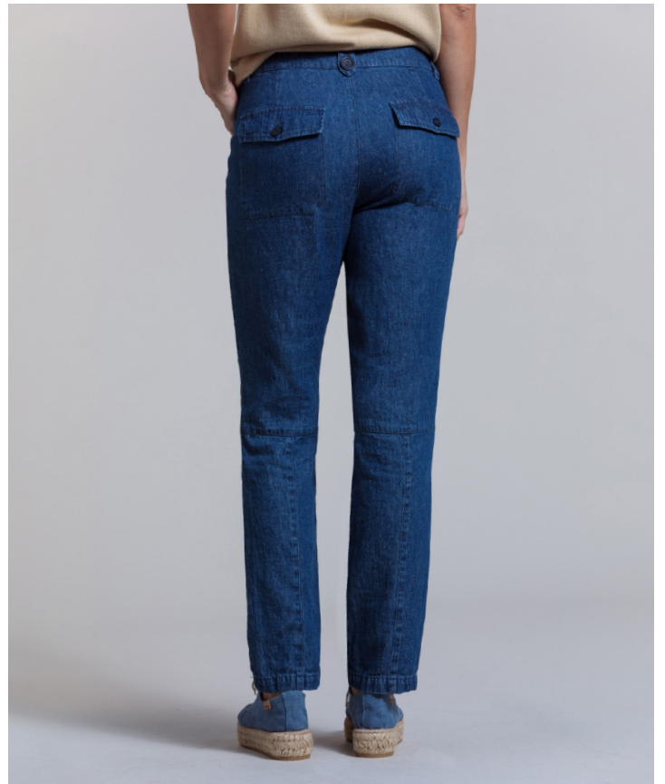
COUNTRY TROUSER STYLE: JOANE CONTENT: 55% HEMP 45% ORG.COTTON COLOR: DARK WASH DENIM