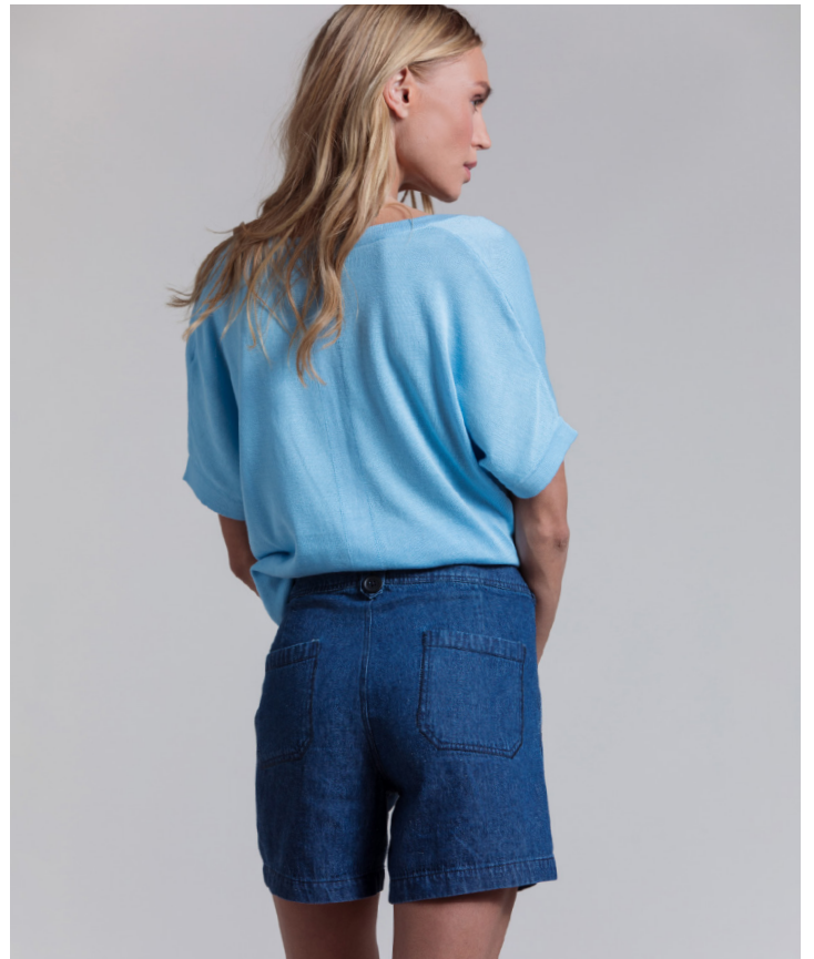
UTILITY SHORTS STYLE: ZOLA CONTENT: 55% HEMP 45% ORG.COTTON COLOR: DARK WASH DENIM