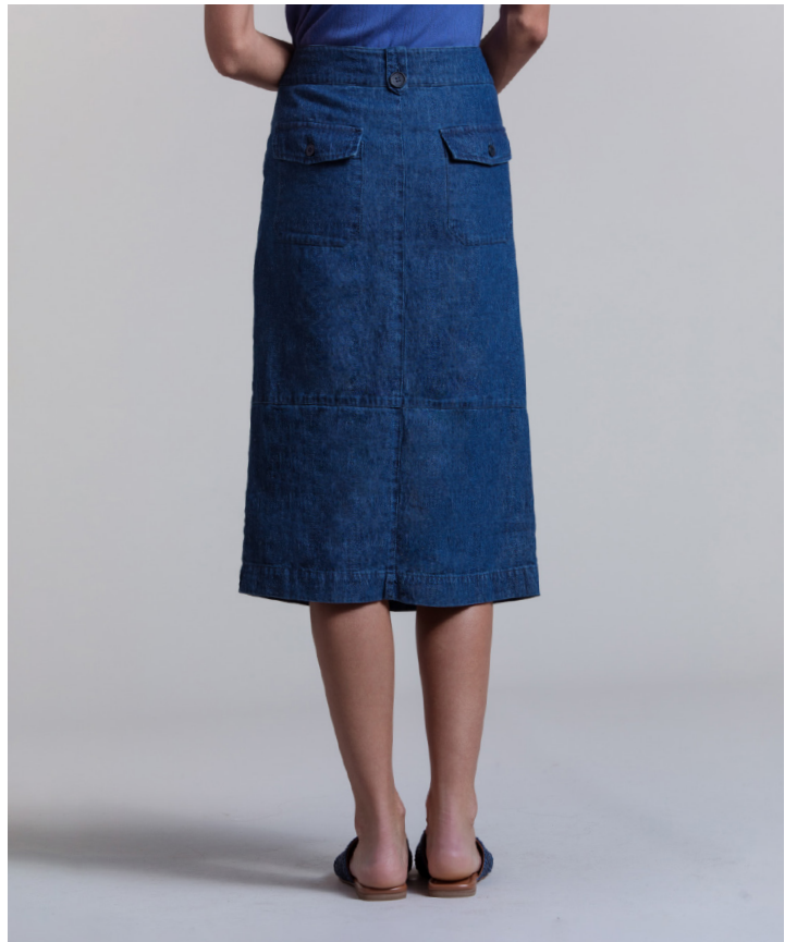
UTILITY CARGO SKIRT STYLE: ANGIE CONTENT: 55% HEMP 45% ORG.COTTON COLOR: DARK WASH DENIM