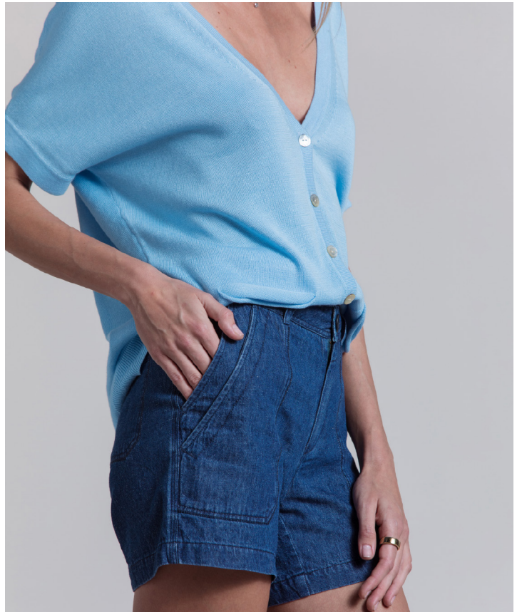
FULLY FASHIONED KNIT CARDIGAN STYLE: CHANTALE CONTENT: 40% COTTON 60% VISCOSE, 14GG COLOR: OCEAN