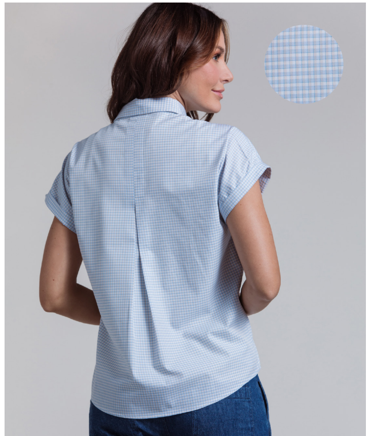
RELAXED SHORT SLEEVE SHIRT STYLE: CAITLIN CONTENT: 50% POLYESTER, 30% TENCEL, 20% RAYON FROM BAMBOO COLOR: GINGHAM, BLISSFUL BLUE/OC