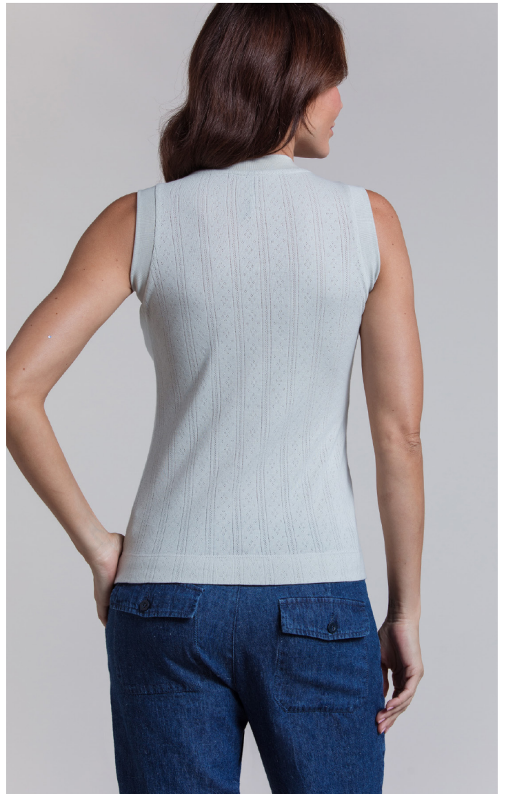
SLEEVELESS CREW TOP WITH WIDE RIB "L" POINTELLE- RELAXED FIT STYLE: NINA CONTENT: 100% COTTON COLOR: SAGE