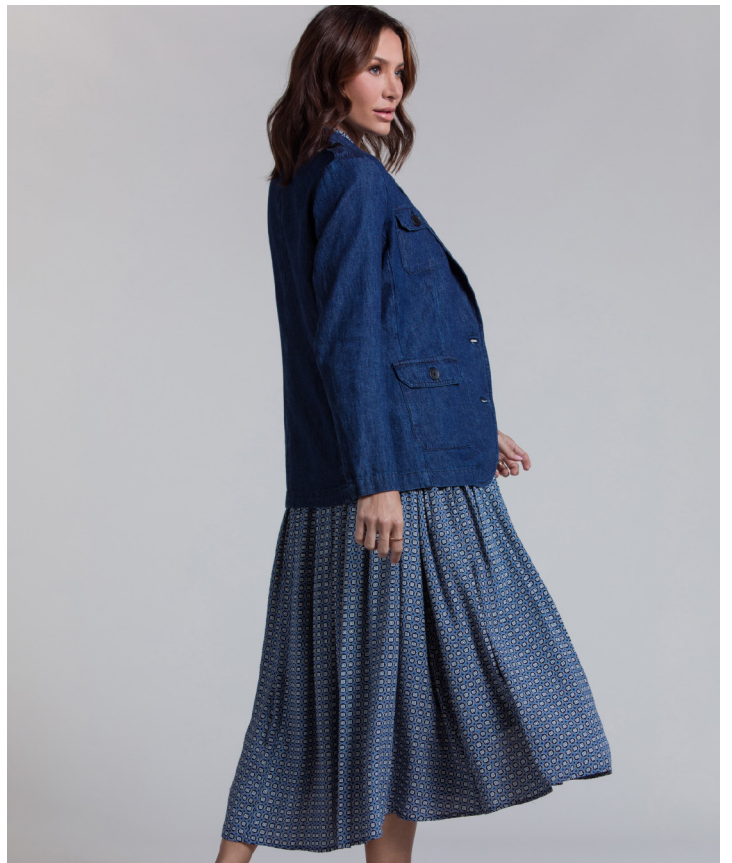
MIDI TIERED DRESS STYLE: JENNA CONTENT: 100% BUBBLE RAYON COLOR: INDIGO PRINT DECO