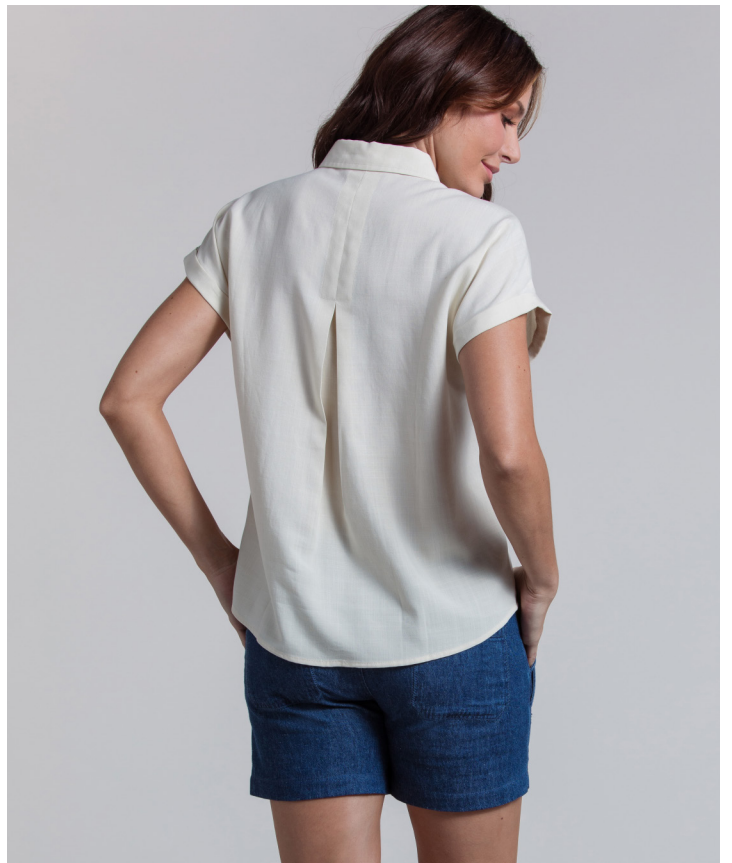
RELAXED SHORT SLEEVE SHIRT STYLE: GLENDA CONTENT: 100% TENCEL COLOR: LINEN