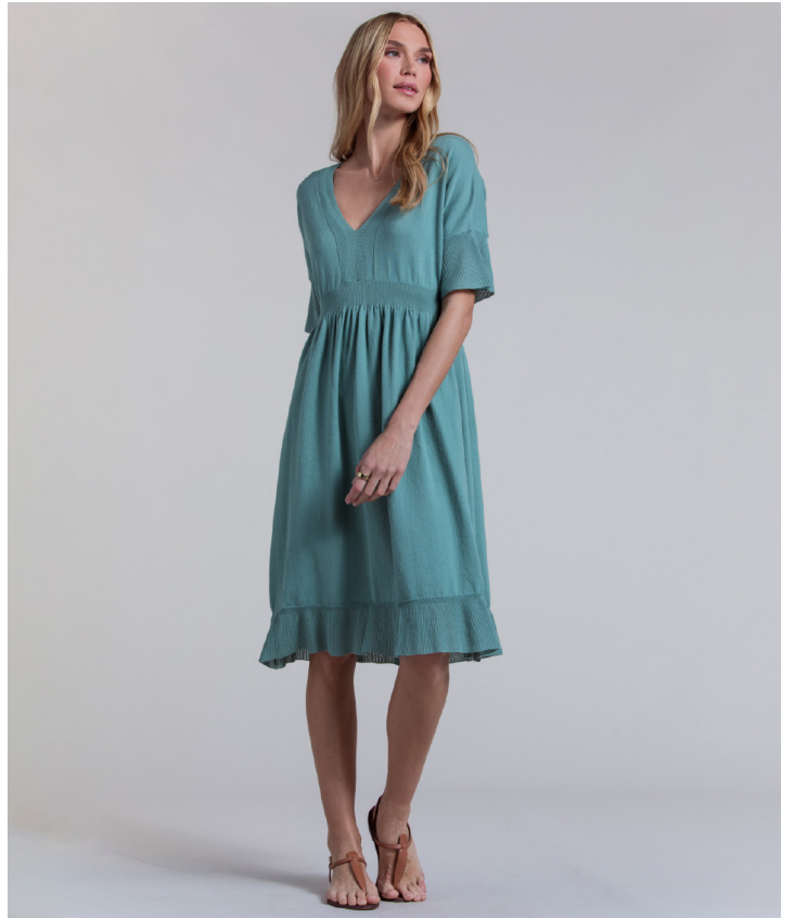
BLUE SUNRISE Size range: XS-XL & Plus 1X-3X