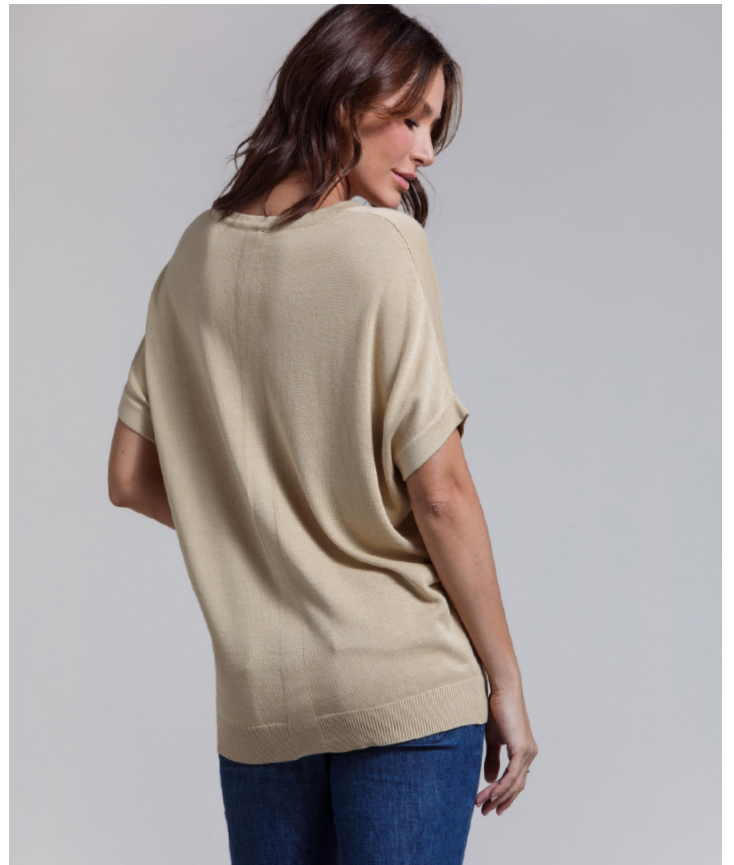
FULLY FASHIONED KNIT CARDIGAN STYLE: CHANTALE CONTENT: 40% COTTON 60% VISCOSE, 14GG COLOR: DORE